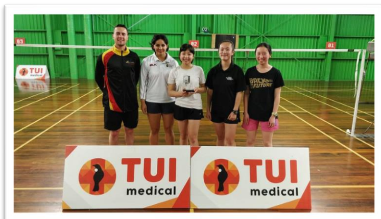
Hillcrest High School 1A – winners Division 1 Girls