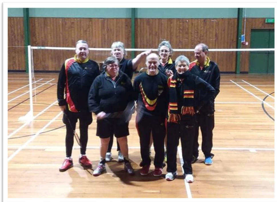
"Vets 3 Team"