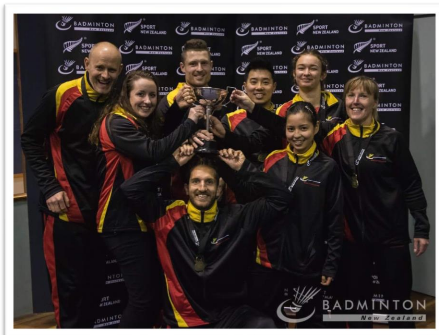
“Wisden Cup Team 2018”

For the 5 th time in 8 years Waikato has won the prestigious Wisden Cup competition, New Zealand's Division 1 Inter-Association league. After a disruptive preparation with lots of setbacks and injuries the players in the team pulled together and despite a loss in the preliminary round against the top seed and heavy favourite North Harbour, this result was turned around in the final with a 4-1 win in a new format which saw the Wisden Cup Live on Sky TV for the very first time.