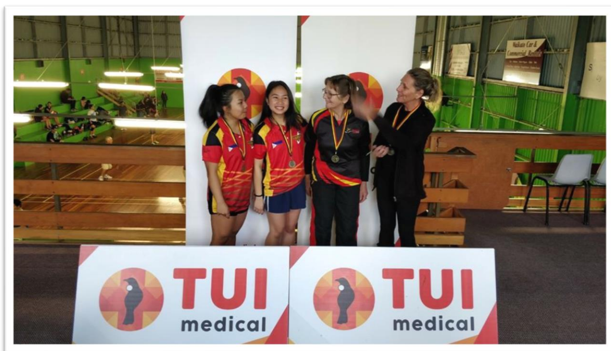
“C Grade Winners & Runners Up”