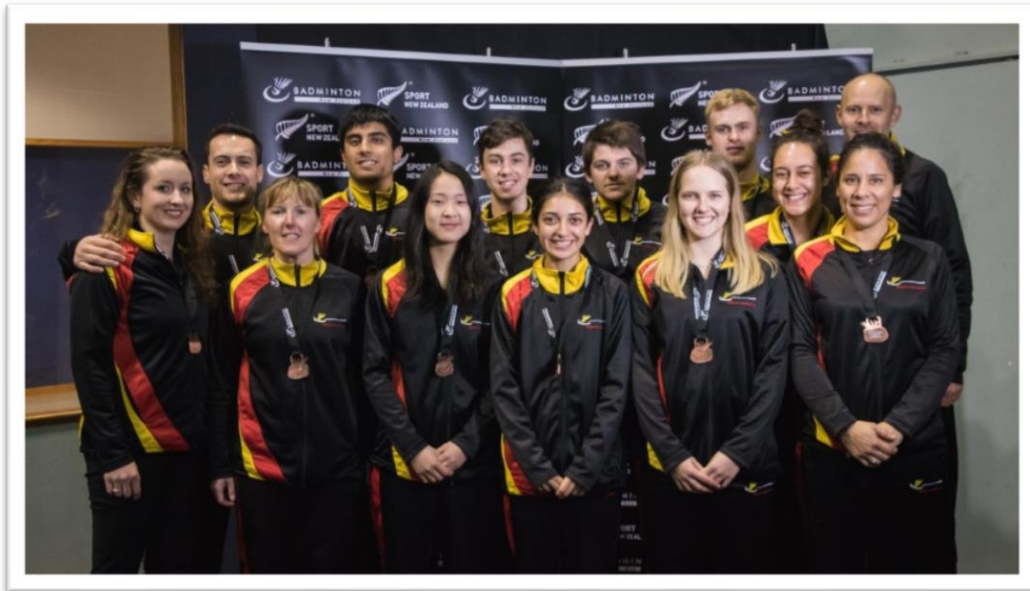
Slazenger Cup Team – Bronze Medal 2018