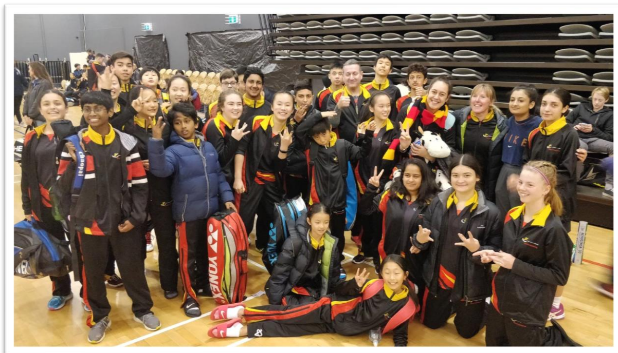
“The Crew” – NZ National Junior Team Championships